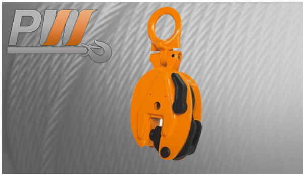
Lifting Clamp CD 1 Ton