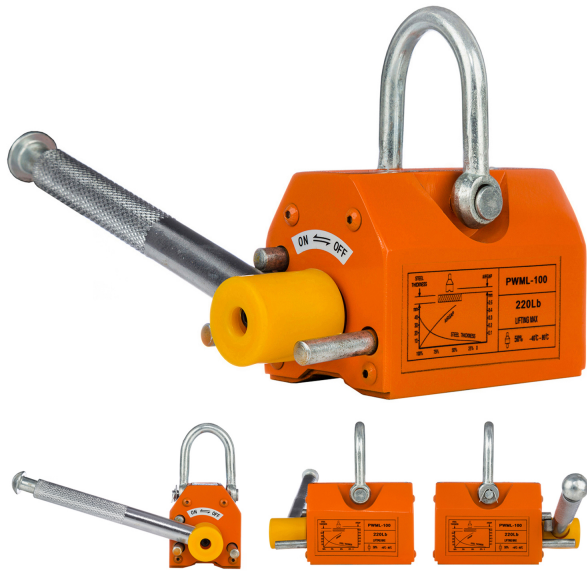
Permanent Magnetic Lifter 220 lb. / 100 kg