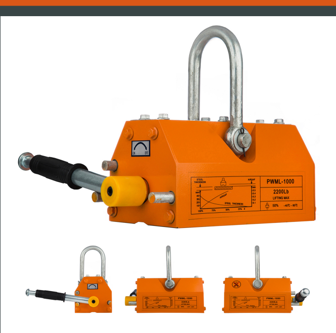
Permanent Magnetic Lifter 2200 lb. / 1000 kg